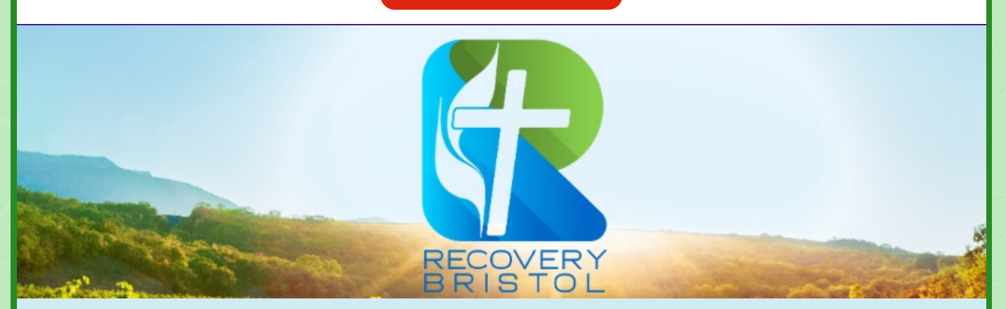
Recovery at Bristol Thursday at 6:15 p.m. ~ Fellowship Hall